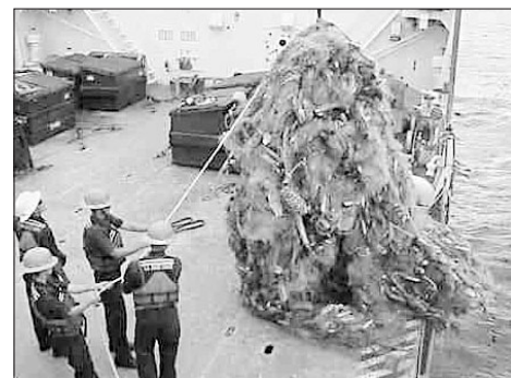
Crew members from the Coast Guard Walnut recover part of the 57,000 pounds of marine debris from the northwestern Hawaiian islands.

plastics in the marine environment in a whole host of problems including invasion of marine life through plastic debris, colonization of plankton on plastic debris, introduction of exotic species, algal blooms, and depositing PCB-like pollutants along their path as they float through the seven seas,” said Bruce McKay, senior researcher for SeaWeb. “It appears that plastics allow for a lot of algae to adhere to it and travel for miles and miles. Now, some are suggesting that there might be a connection between plastic pollution and algal blooms — which have led to massive fish kills due to either direct toxicity or suffocation.”