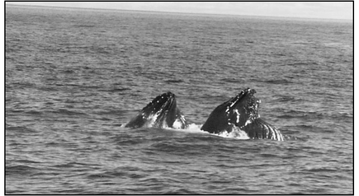
Marine species long known to be in decline have only recently been discovered to likely be victims of industrial pollutants.

Some government agencies, such as the Environmental Protection Agency, regularly install fish advisories warning the public to limit their intake of certain fish because they contain high