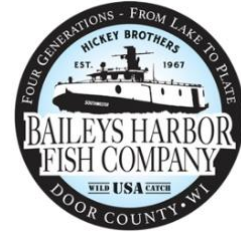
Baileys Harbor Fish Co. Baileys Harbor, WI