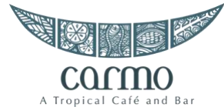
Carmo New Orleans, LA