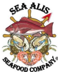
Sea Alis Seafood Company Long Beach, MS