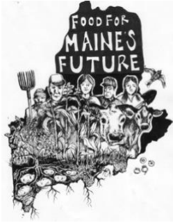
Food For Maine's Future