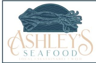
Ashley's Seafood Eureka, CA