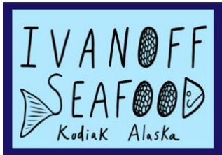
Ivanoff Seafood Kodiak, AK