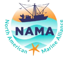
North American Marine Alliance Gloucester, MA