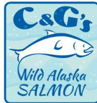
C&G's Wild Alaska Salmon Boise, ID