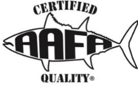
American Albacore Fishing Association