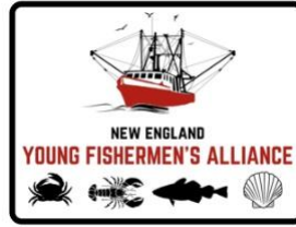
New England Young Fishermen's Alliance