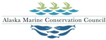
Alaska Marine Conservation Council