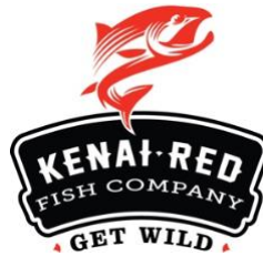
Kenai Red Fish Co.