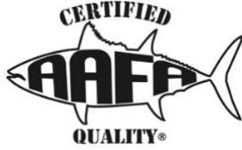
American Albacore Fishing Association