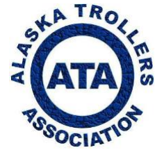
Alaska Trollers Association