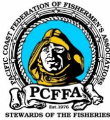
Pacific Coast Federation of Fishermen's Associations