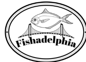
Fishadelphia Philadelphia, PA