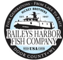
Baileys Harbor Fish Co. Baileys Harbor, WI