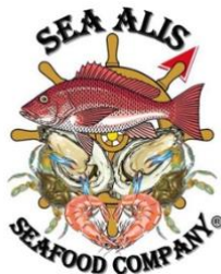
Sea Alis Seafood Company Long Beach, MS