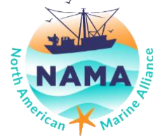
North American Marine Alliance Gloucester, MA