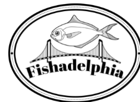
Fishadelphia Philadelphia, PA